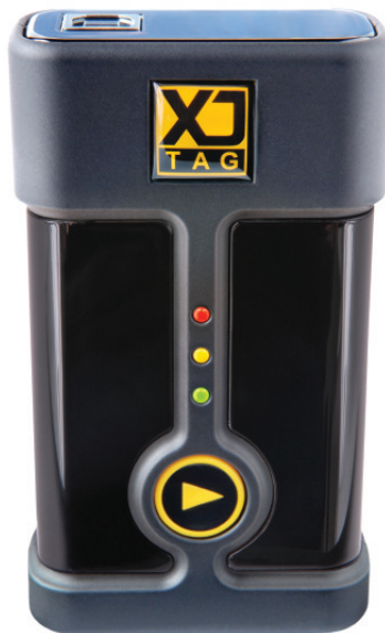
Available in black and yellow.*